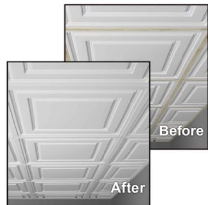
EZ-On Grid Covers can be used with Ceilume's thermoformed ceiling panels to transform the appearance of a room.