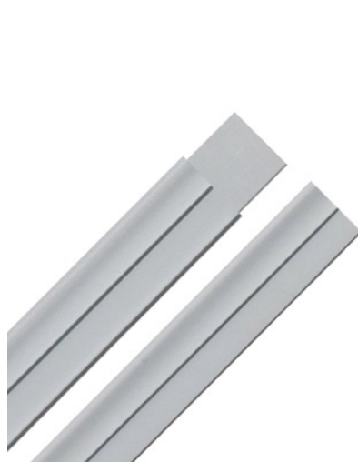
Covers for T-Bars (top) have out tabs for smooth junctions at grid intersections. A second profile (bottom) trims wall perimeter angles.

Download high resolution photos and Word document: www.ceilume.com/pro/press.cfm