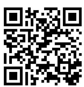
Scan to View Installation Video

Ceilume's Signature ceiling tiles and panels can be mounted directly to a smooth, clean, and firm installation surface using adhesive. Tiles butt together when installed, and self-adhering strips are required to cover the joints between tiles.