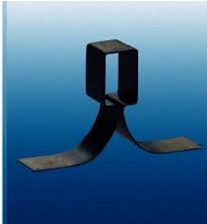
Figure 1 – Uplift Prevention Clips Details

The space above the panels and tiles shall not be used as an air circulation plenum.